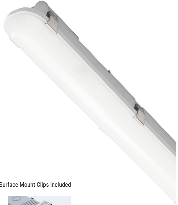
Surface Mount Clips included